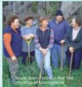
Camperdown-Timboon Rail Trail Committee of Management

Pilot Project: Ballan, Gordon, Mt Egerton, Blackwood, Myrniong, Coimadai, Greendale, Bungaree